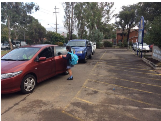
AN EXAMPLE OF SAFE BEHAVIOUR